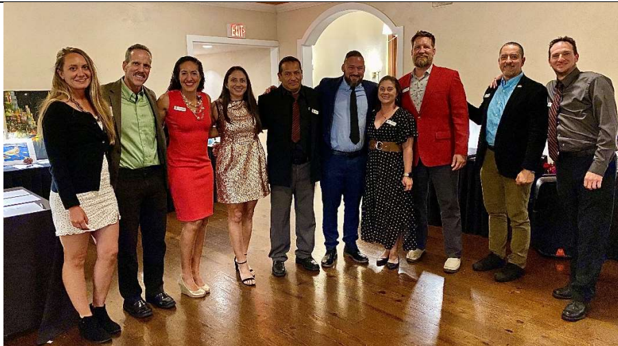
Treasure Coast Chapter Board of Directors

We are so grateful for all the items donated for our silent auction and raffle. We raised $1,060.00 which will be used to fund a scholarship for a graduating senior at the Gale Academy of Environmental Science and Technology at the Forest Hill Community High School. The Annual Awards Banquet is an amazing way for the Treasure Coast Chapter to end each year on a high note, honoring our members and celebrating all of the achievements of our incredibly talented group. We are looking forward to a successful year ahead in 2024!