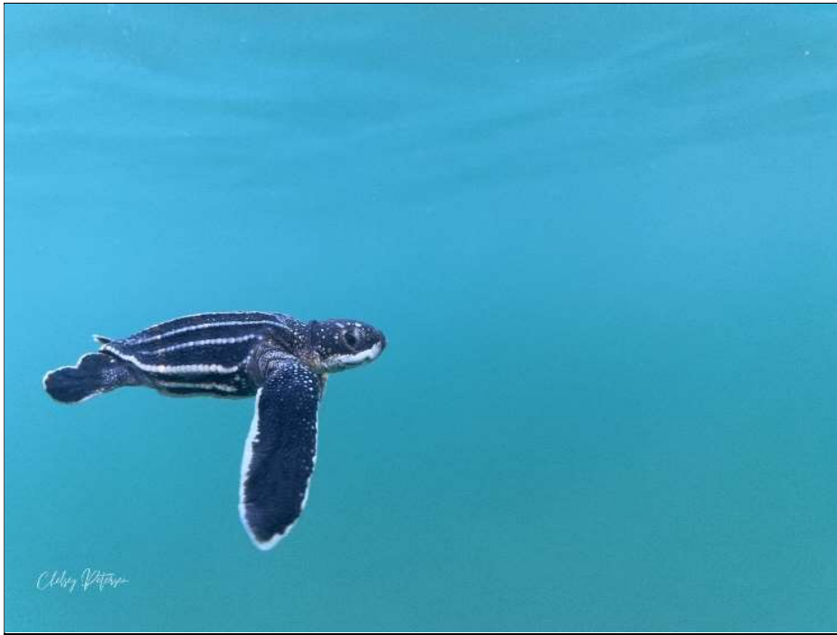
Leatherback Sea Turtle Hatchling